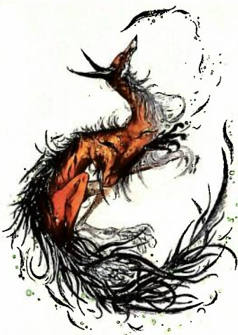
Surreal art: pencil drawing 16,53 x 23,39 inches

INFLAME: You, the burning soul within each individual, yearns for peace and kindness. Recognize our shared needs, deserving love and safety. Let us not extinguish the flames within others.