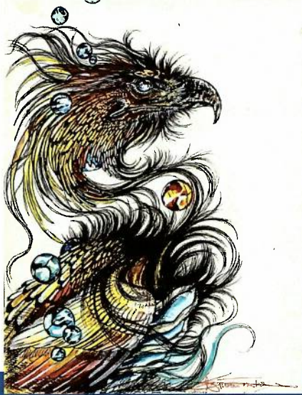
Surrealart: pencil drawing 20x29 inches

Hailing from Switzerland, I discovered my passion for animal conservation inspired by my mother's lifelong dedication. My deep connection with animals fuels my art, expressing the world's light and darkness through a Surrealistic lens. Despite studying medicine, my artistic calling persisted, merging with activism. Now, I use my creativity to speak for the voiceless and fight for our planet's protection. Art transcends language, touching souls and holding the power to change the world.